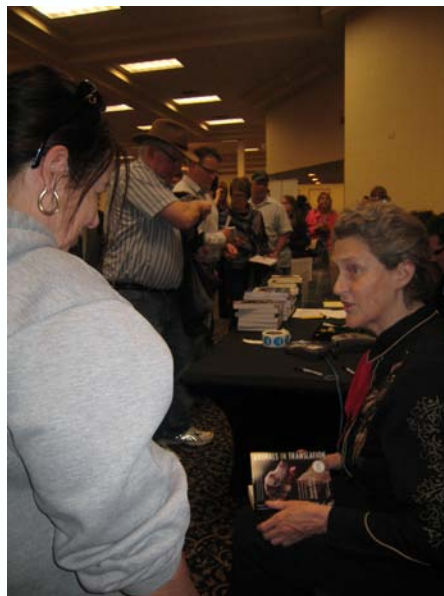
Dr. Temple Grandin