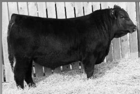
Bar-E-L Candidate 10C