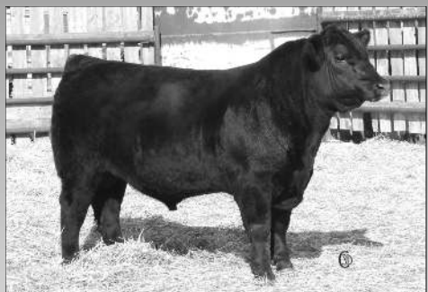
Young Dale Absolute 3D